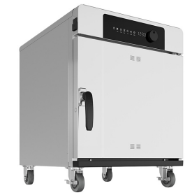
Shown with Deluxe control